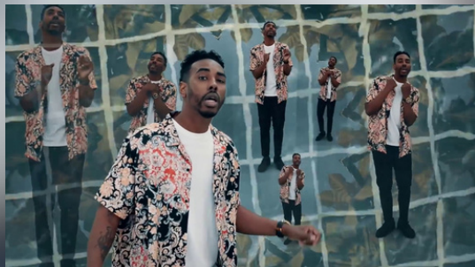
She Makes Me OFFICIAL MUSIC VIDEO