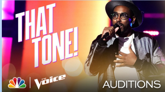
The Voice NBC